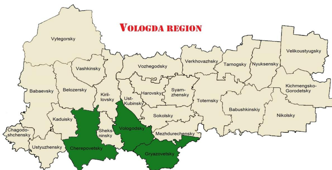
Fig. 3. / Рис. 3. The first typological group of municipal districts according to the level of agricultural production in the Vologda region and its individual characteristics / Первая типологическая группа муниципальных районов по уровню сельскохозяйственного производства в Вологодской области и ее индивидуальным особенностям

The first typological group is represented by the «leaders» districts – Vologodsky, Gryazovetsky and Cherepovetsky. They differ significantly from the rest by the level of agricultural production; they have the highest aggregate value by almost all indicators and are characterized by the availability of the largest resources for production (e.g., sown area and arable land (54,8 thousand ha and 57,2 thousand ha respectively), the number of cattle and cows, the number of rural population, energy equipment, energy availability, equipment, etc.), high production indicators in the branches of animal husbandry and crop production, as well as a strong financial and economic position (figure 3).