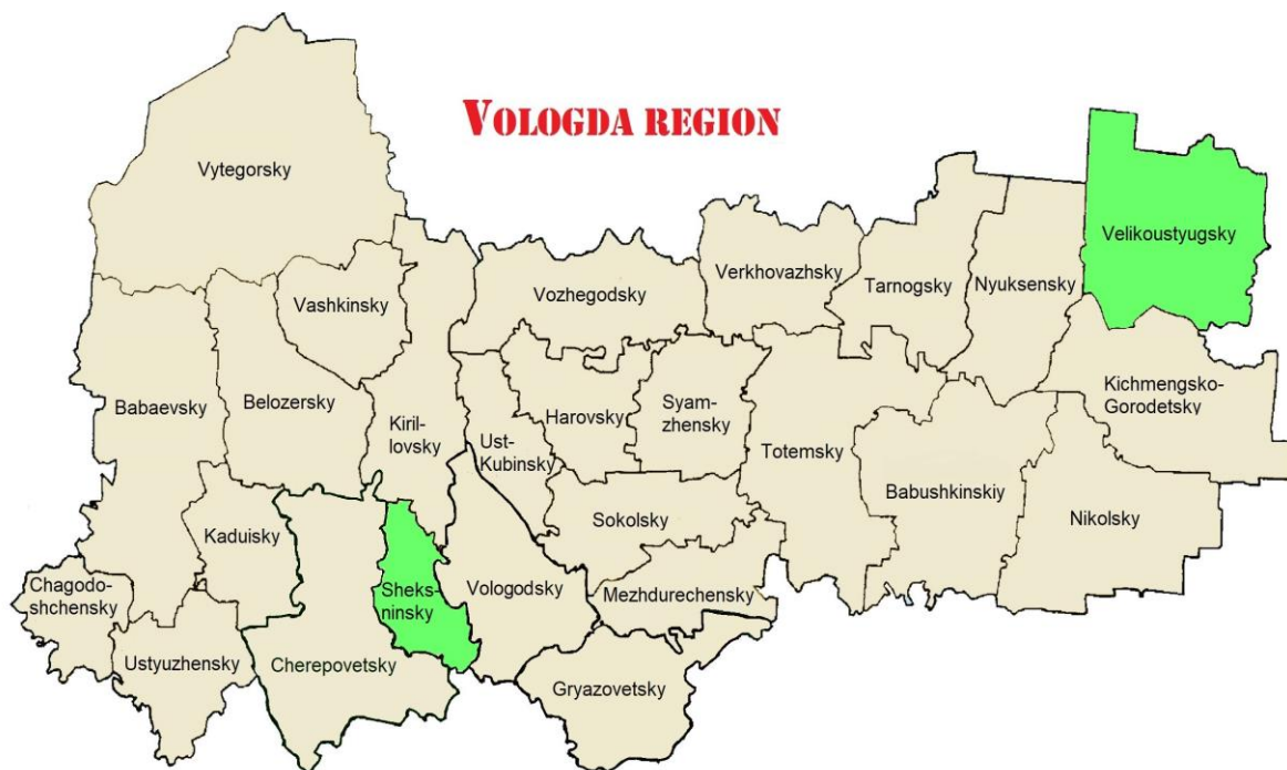
Fig. 4. / Рис. 4. The second typological group of municipal districts according to the level of agricultural production in the Vologda region and its individual characteristics / Вторая типологическая группа муниципальных районов по уровню сельскохозяйственного производства в Вологодской области и ее индивидуальным особенностям

The second typological group included Velikoustyugsky and Sheksninsky districts (figure 4). This group lags a little behind the first group of «leaders» in terms of the values of indicators, but also has quite high production, economic and financial results. For example, the number of cows amounted to 10825 head in 2020 (2,2 times more than in the third group and almost three times lower than in the first group), and the values of indicators on gross milk yield, volume of grain production, areas of grain and forage land are much higher than in the third and fourth groups. This group has the best indicators of labour productivity (27971,3 rubles), capital productivity (2,4 rubles) and production of cattle meat per 100 hectares of farmland (228,7 quintals) among all the districts. This group is characterized by an «above average» level of agricultural development. These districts can further join the first group or serve as «points of growth» of agricultural production in the region.