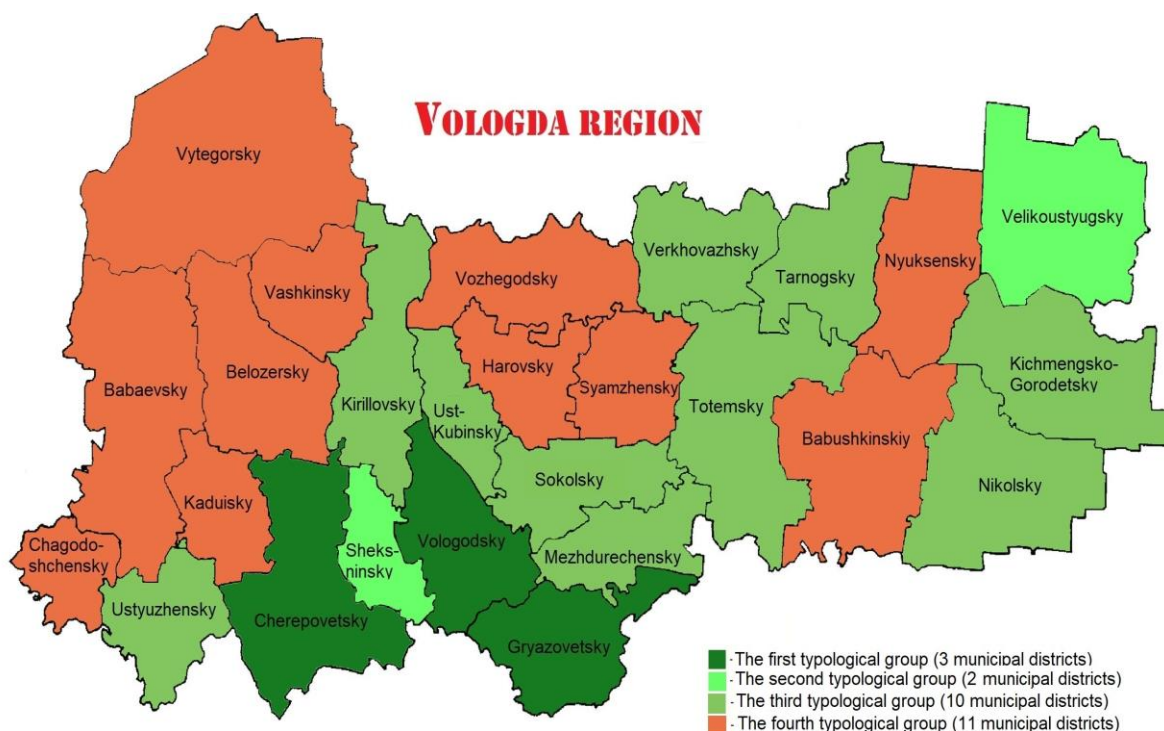
Fig. 7. / Рис. 7. Territorial differentiation of agricultural production in the Vologda region in 2020 / Территориальная дифференциация сельскохозяйственного производства в Вологодской области в 2020 году

Thus, the study has shown a deep territorial differentiation of the Vologda region's municipal districts by the level of agricultural production (figure 7). The districts of the first and second typological groups are located mainly in the south and south-west of the region's territory (except for Veliky Ustyug District, located in the second group) and are adjacent to major developed cities – Vologda, Cherepovets, Sheksna, Veliky Ustyug. The districts of the third typological group are located in the central and eastern part of the Oblast, the fourth in the west, the north and two districts (Babushkinsky and Nyksensky) in the east.